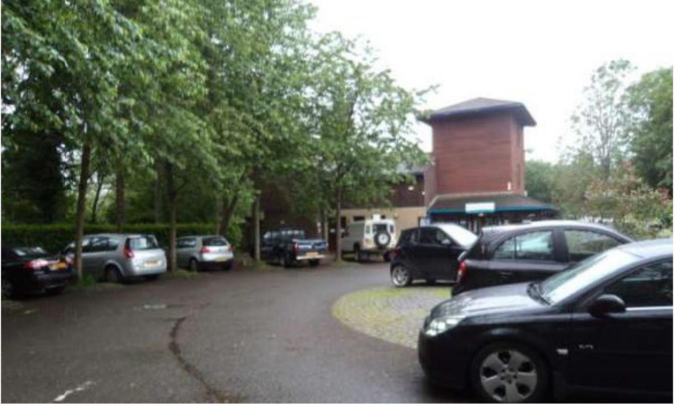
Topsy's view from her mooring.

Topsy is a luxury wide beam canal boat moored on the River Avon at Bath Marina. She is fitted to a high standard and comfortably sleeps six people in two cabins and on sofa beds in the salon.